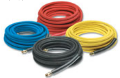
High-pressure hoses from 30 to 150-ft. lengths